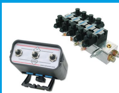
ELETRIC BOX OIL