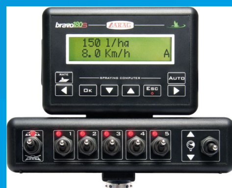
COMPUTER BRAVO 180S