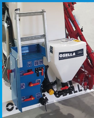
MIXER AND VALVE BOX (INDEPENDENT WASHING) ALTERNATIVE ONLY MIXER