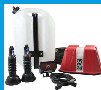
TRAIL TRACING SYSTEM