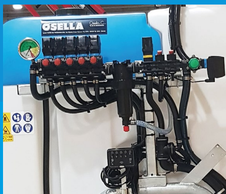
PUSH PANEL FOR CHEMICAL PRODUCT KIT