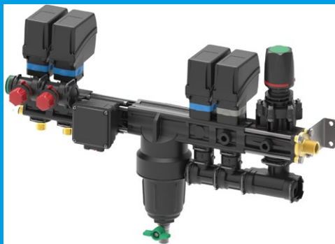
ELECTRIC PRESS. REGUL.