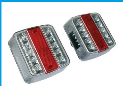
LIGHTING LED KIT