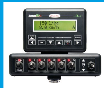
BRAVO 180S COMPUTER

Quality towed Mistblower suitable for treatments on crops with medium/large planting density. Thanks to its small size, excellent manoeuvrability, and high-performance fan, it can be used for the precise treatments on awning vineyards, orchards, olive groves and nursery crops. The new towed Mistblower is complete with circuit washer and washbasin integrated in the main tank, a frame with attention to detail to be reliable, manageable, and productive. Possibility of installation with multiple components including steering rudders, hydraulics, and computers. Fitted with 620- and 820-mm fan made entirely in Italy. The 9 fan blades are made in composite material and they can be adjusted in three different angles to adapt the unit to the tractor available. The fans can be fitted with a metal centrifugal clutch with ferodo. Groups are fitted with multipliers at a neutral speed and point.