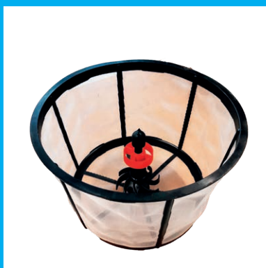
HYDR. POWDER MIXER ASSEMBLY ON THE FILTER