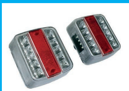
LIGHTING LED KIT