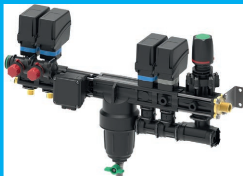
ELECTRIC PRESS. REGUL.