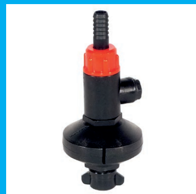
TANK RINSING NOZZLE KIT