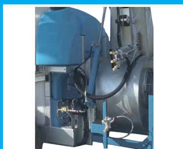
KIT TREE TRUNK TREATMENT