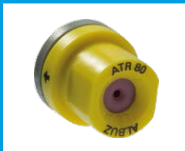
LOW VOLUME KIT