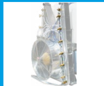
ADJUSTABLE DOUBLE ANTIDRIP BRASS NOZZLES

Mistblower brought to the third point, suitable for treatments on crops with small/medium planting density. Thanks to its compact size and high-performance fan, it can be used for the precise treatments on vineyards, uniform and symmetrical of espalier cultivation both in hilly and plain areas. The new ATM OSPL line boasts a tank with modern lines that incorporates in its compact shape the system washer and washbasin tanks, an innovative solid frame and quality components.