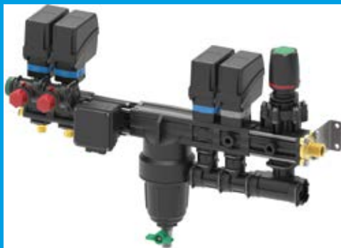
ELECTRIC PRESS. REGUL.