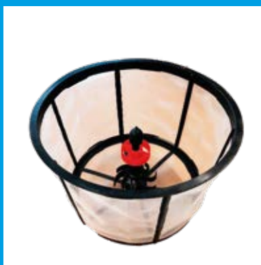
HYDR. POWDER MIXER ASSEMBLY ON THE FILTER