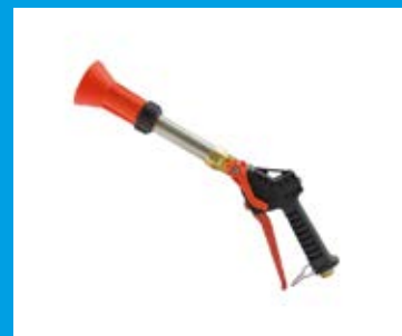
TURBO SPRAY GUN

Mistblower brought to the third point, suitable for various treatments on maize crops. The height of the gun tube has been designed to ensure homogeneous spraying to defeat the corn borer. Thanks to its powerful dual impeller gun and the implementation of adjustable nozzles on the entire air outlet side obtains a uniform distribution and an exceptional range of 42-46 Mt. Wide possibility of hydraulic movement: 360° rotation adjustment, adjustment in height 50 cm and inclination 15° right/left. The 3PCP ATM Mistblower stands out for the quality of its components, its sturdy frame, and the possibility of configuring it with numerous accessories in full compliance regulations as the safety and protection of the environment. Fan assemblies can be single or double impeller with double speed multipliers and neutral point and centrifugal clutch. Available in the 1200 litre version