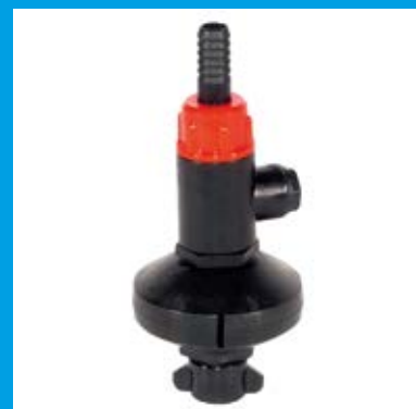
TANK RINSING NOZZLE KIT