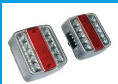
LIGHTING LED KIT