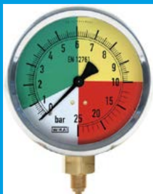
Ø 100 WIKA PRESSURE GAUGE